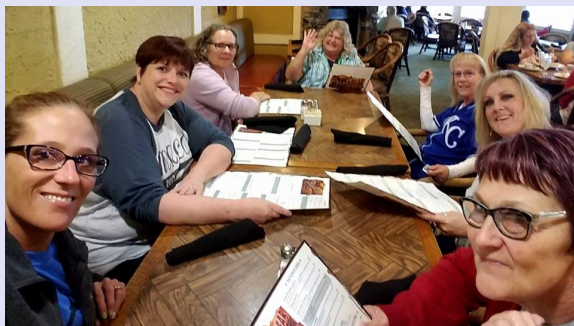
Who said dinner on your own?