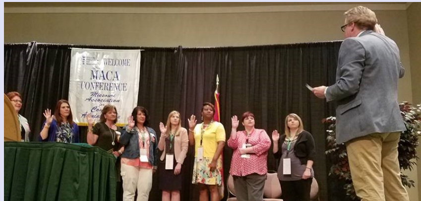
New MACA 2017-18 Board members are sworn in