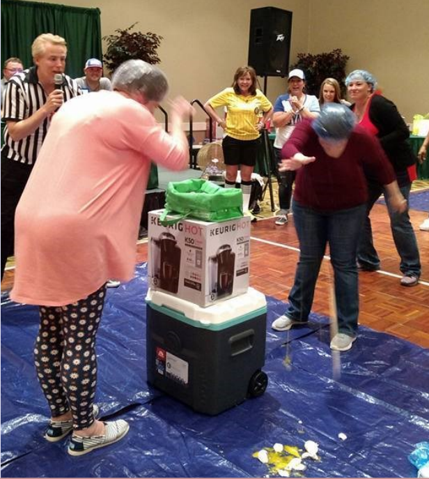
Food fight for prizes