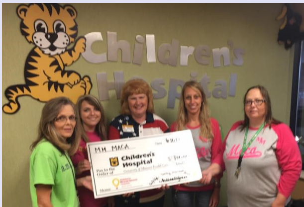
University of Missouri Children's Hospital Civic Project—$700 check presentation