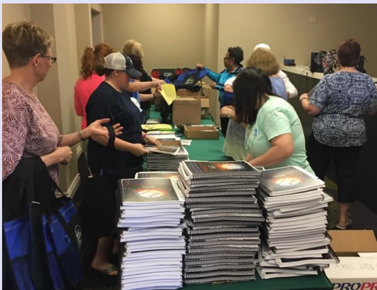
MACA Board readies conference handouts