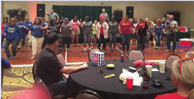
"Toeing the Line"